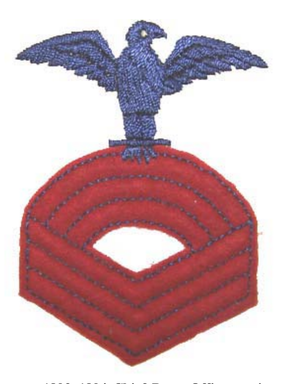
1893–1894 Chief Petty Officer rating badge without a specialty mark for white clothing. A specialty mark was added depending on the rate. The eagle was white for blue clothing.