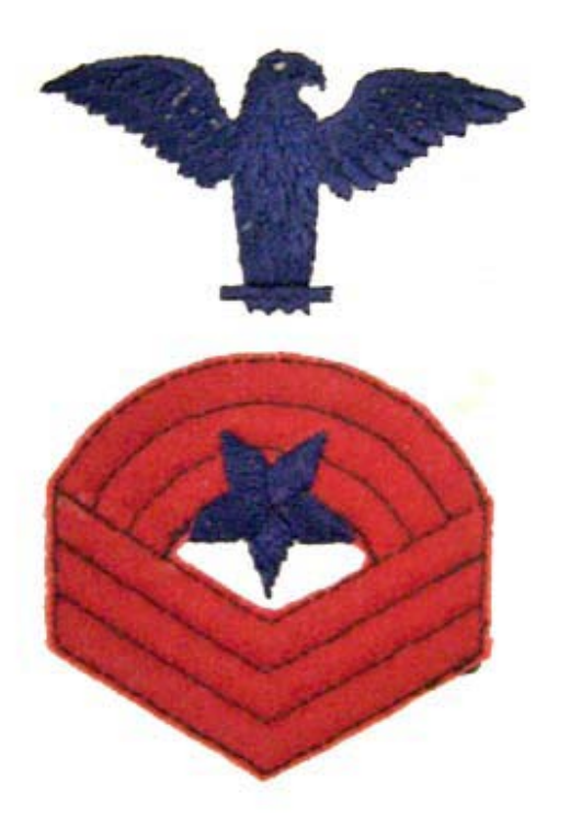
1893 Chief Master at Arms rating badge for white clothing. This style was worn by Chief Master at Arms from 1893 through 1894. for white clothing.