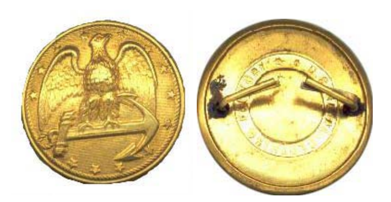
1893 Chief Petty Officer cap device worn by chief petty officers from 1893–1897. The same device was worn by first class petty officer prior to the establishment of the Chief Petty Officer rating in 1893.

Adapted from "Goat Locker website; CPO Resources; General Order No. 409," by direction of executive order, 1893.