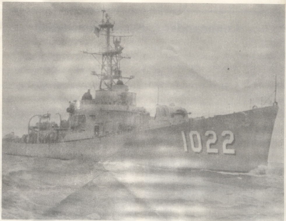
USS LEIFER (DE-1022)